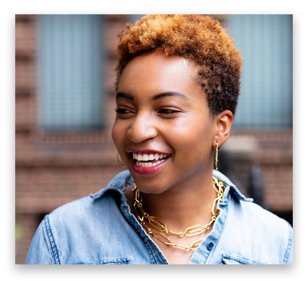
WHEN DID YOU DECIDE TO MAKE MUSIC AND ENTERTAINMENT A FULL-TIME CAREER?

Once I realized how much I wanted to pursue singing full-time, I struggled to stay motivated and focused at my corporate media job. All I could do was daydream about performing more and all the while I was becoming my "cubicle less". After mistake number 25 billion, my boss suggested (in the nicest way possible under the circumstances) that I follow my dream. I took her up on that suggestion almost immediately! By my last day in the office, I had managed to book several shows. Then I stretched my last couple of paychecks to cover my living expenses for the rest of the winter and all the way through middle of spring of the following year. Before that next summer ended, I found a job as a hostess at a local restaurant, and began the process of reinventing myself into "Carla G" - the chanteuse